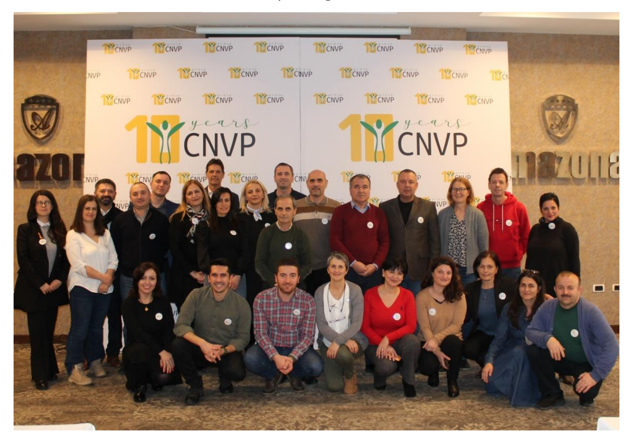
Figure 4 CNVP celebrating 10-th anniversary.

During the event, the Chair of the Supervisory Board of CNVP, the Executive Board and the main partners, donors and beneficiaries from Albania, Kosovo, North Macedonia and Montenegro, addressed speeches highlighting CNVP's contribution in the Western Balkans throughout a decade. Certificates of gratitude were awarded to the Embassy of Sweden in Tirana, Embassy of Sweden in Pristina and Prespa Ohrid Nature Trust (PONT) for their outstanding contribution in supporting CNVP to achieve its mission in building a greener economic environment and improving the livelihoods of rural communities.