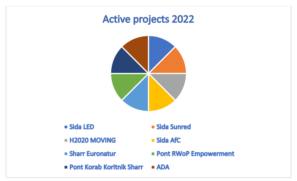
Figure 2 Active projects under implementation during 2022

During 2022, eight active projects were under implementation in the Balkans. The figure shows the main projects under implementation.