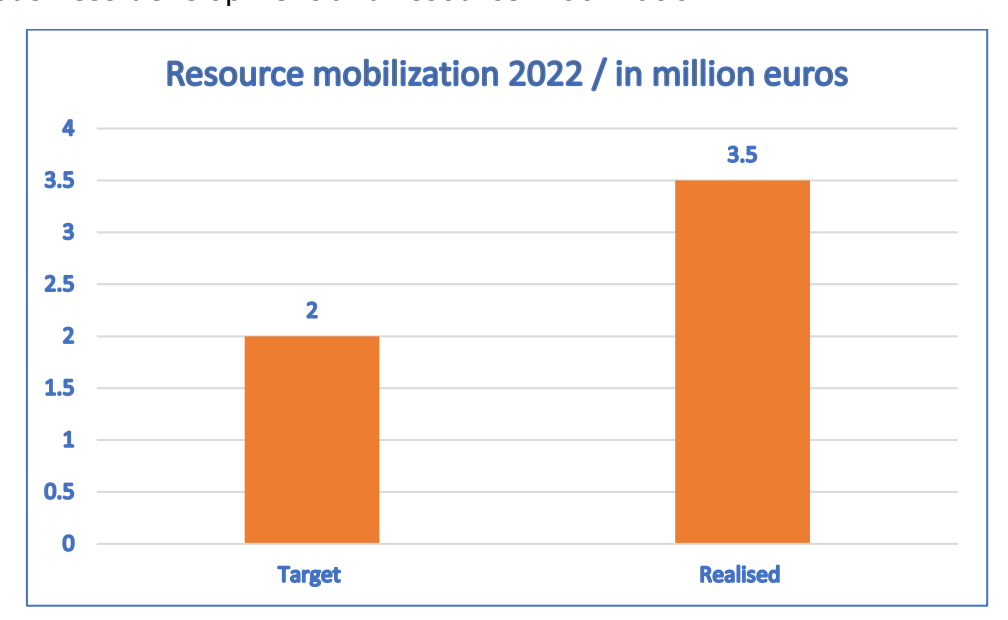
Figure 1 Resource mobilization during 2022

CNVP has successfully managed to strengthen partnerships with its key strategic partners, such as Sida, PONT, ADA-ICEP, Euronature etc. 2022 was very successful in terms of business development and resource mobilization.